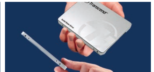
Ultra-slim 6.8mm form factor