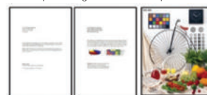
#1 Black Text #2 Colour #3 Photo 4R

*1 Print speed (Pages Per Minute) is calculated when printed on A4 plain paper in the fastest mode, 10 x 15 cm photo print speed when printed on Epson Premium Glossy Photo Paper. Print speed may vary depending on system configuration, print mode, document complexity, software, type of paper used and connectivity. Print speed does not include processing time on host computer.